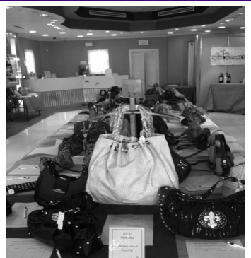
Auction tables at Purses With A Purpose at Destin Commons