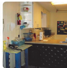
Emergency Shelter Kitchen Before Renovation