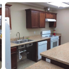
Emergency Shelter Kitchen After Renovation

complete, the first phase is already making a difference in the lives of those we serve. One family stayed in our emergency shelter before and after renovations began. When they recently returned for their second stay, the children's jaws dropped when they saw