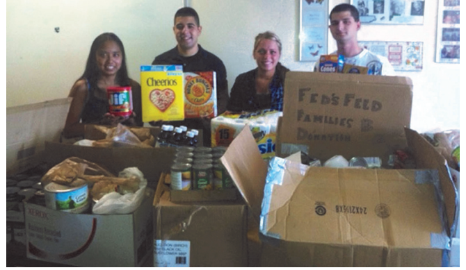
(Right): Thanks to the generous people at Hurlburt who participated in the Feds Feed Families drive which was coordinated this year by Hurlburt Airman's Voice.