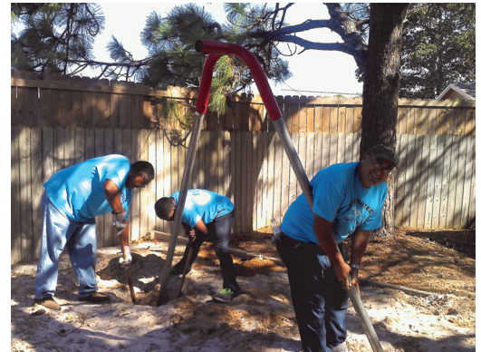
(Right): Employees from ThomCo Enterprises hard at work on the emergency shelter's playground as part of the United Way of Okaloosa and Walton Counties' Day of Caring.